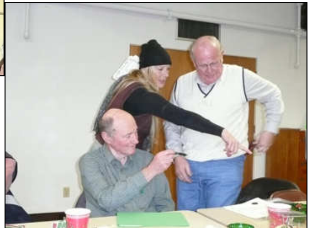
Look a spider!!