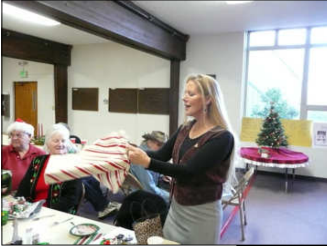
It is not going to bite!!