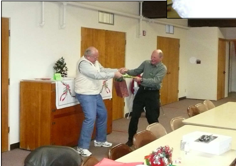
Hate it when two grown men fight over a unknown present!!