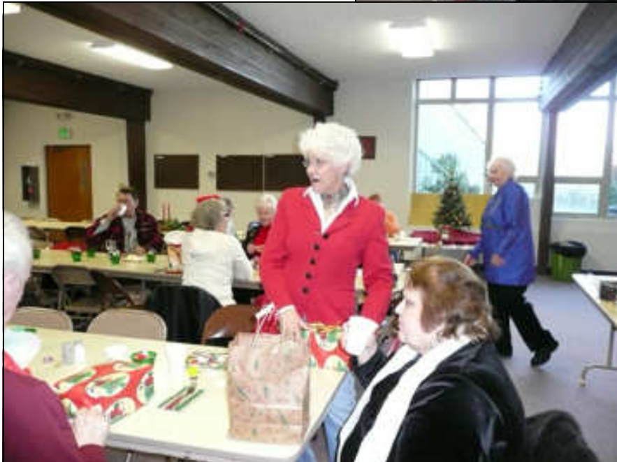
You got me what??