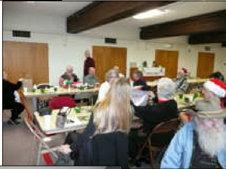
Attendance was a little sparse, but great food and fun prevailed non the less!!